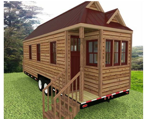
The Cypress® model rendering (unpainted)

The Cypress® is built on an 8' x 24' premium-quality trailer that can be pulled by a one-ton truck and arrives ready for water, electrical and sewage hookups.