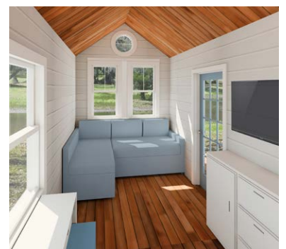
The Lambert model interior renderings