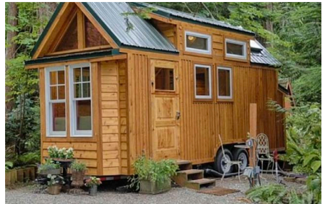
Example of exterior finish to be used on The Hebert's Camp.

The Hebert's Camp is built on an 8' x 24' premium-quality trailer. Each unit arrives ready for water, electrical and sewage hookups or can be outfitted to work off-grid.